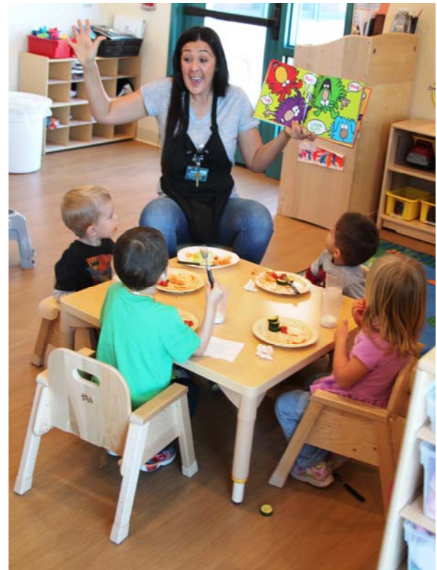
The new outdoor toddler classroom features new eco-friendly furniture. The classroom was made possible by Freeport McMoRan and other generous donors.

The beautifully designed children’s furniture purchased through Community Playthings, is made with certified wood managed by the Forest Stewardship Council where harvesting includes care to prevent habitat destruction and water pollution.