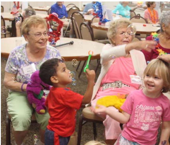
Adult Day Services offers Intergenerational activities with the children from Los Niños del Valle Preschool.