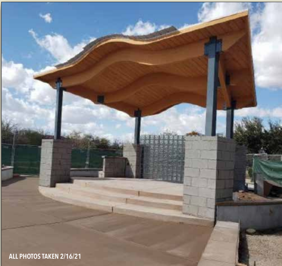
ALL PHOTOS TAKEN 2/16/21

If you'd like to donate or sponsor an item at Center Stage, please contact the Foundation for more information at ext 7910. Or complete the inserted flyer and return to the Foundation.